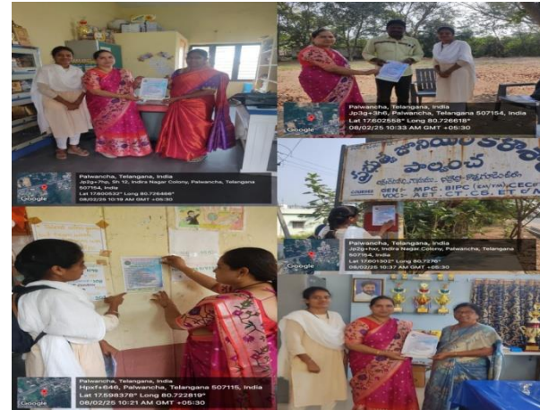
URJC & GJCKOTHAGUDEM