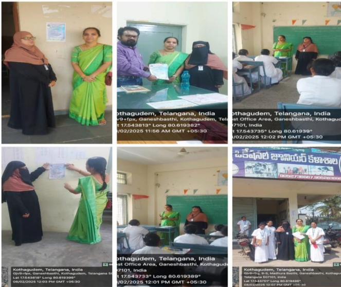
KGBV & GJC CHANDRAGUDEM