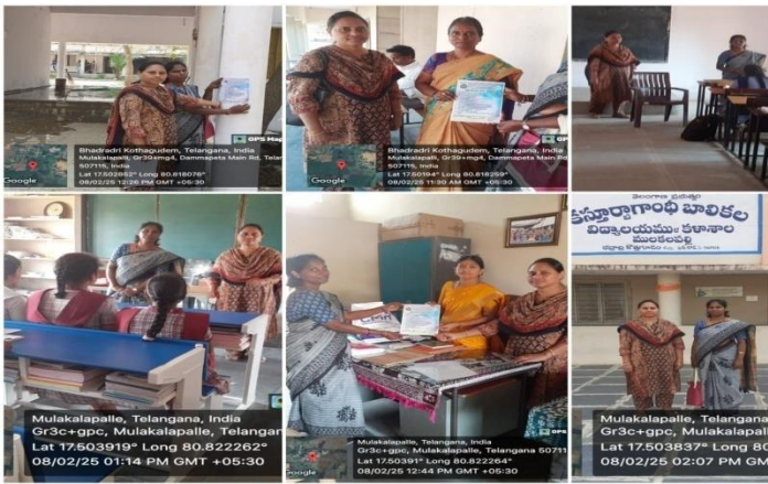
KGBV & GJC MULAKALAPALLI