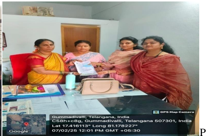
GOVT JR COLLEGE DUMMUGUDEM