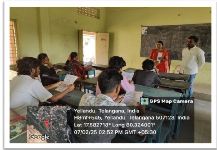
GOVT JT COLLEGE YELLANDU