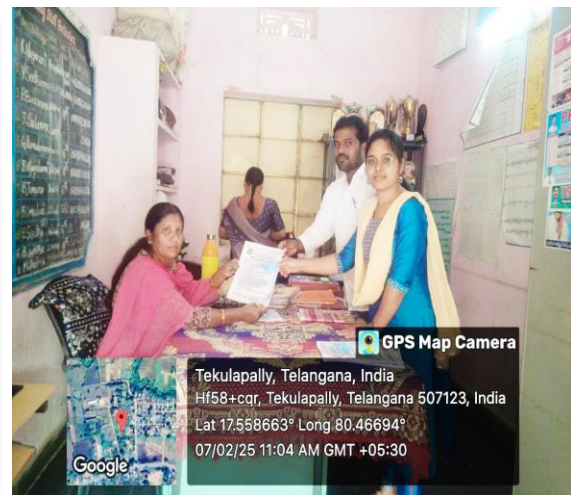
GOVT JR COLLEGE