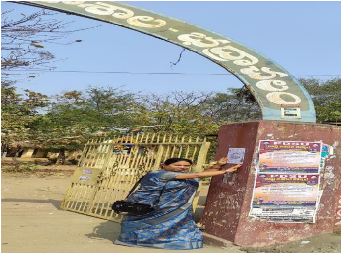
URJC COLLEGE TGTWRJC ANKAMPALEM