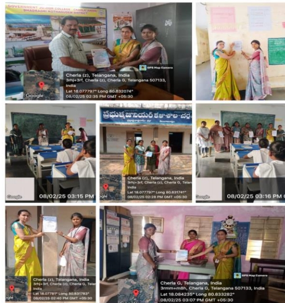
GJC & KGBV CHIRALA